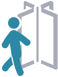
FORMER FORD FACTORY