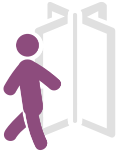
FORMER FORD FACTORY